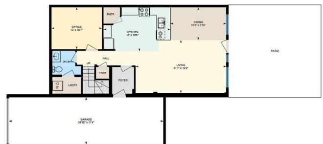
Main Floor Interior Area 856.69 sq ft Excluded Area 415.67 sq ft