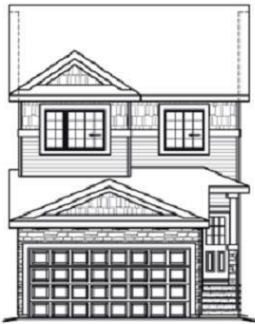
Dugenta VII Job 2562-WB 221 Larch Crescent, Leduc

1,622 sqft 9'-1" Main Floor Ceiling Height Vinyl Plank throughout Main Floor Side Entrance Appliance Allowance Quartz Countertops in Kitchen & Bathrooms Tile in all Second Floor Bathrooms Stand-up Shower in Ensuite High Efficiency Furnace