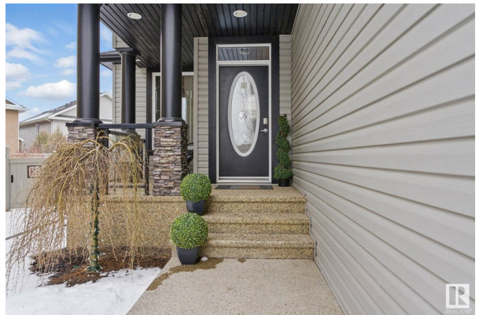
219 Callaghan Dr SW, Edmonton, AB