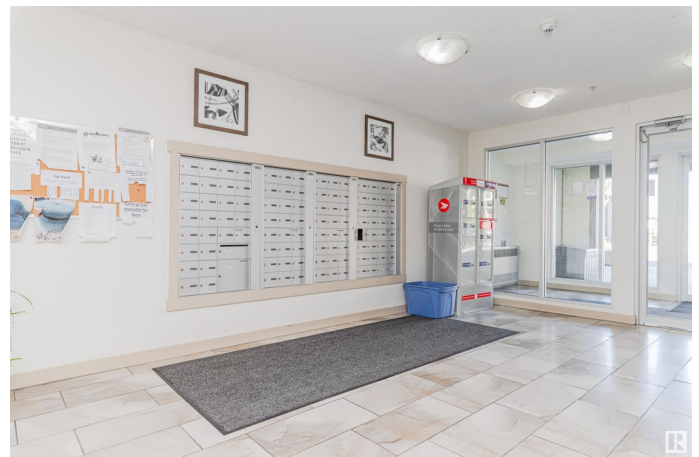
223-5816 Mullen Pl NW, Edmonton, AB